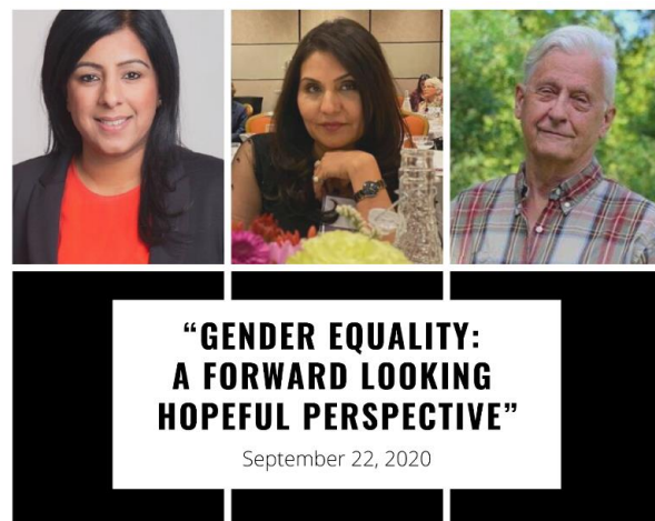
GWPW Canada virtual zoom webinars