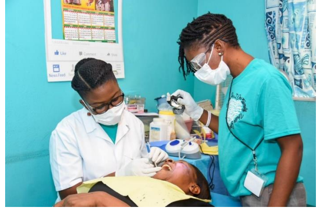
Haiti Medical Mission Trip promoting health and oral hygiene, combating chronic diseases, and providing gynecological care