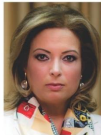
Speaker: Hon. Mdm. María Fernanda Flores de Alemán First Lady, Nicaragua (1997-2002) Congresswoman (2012-present)