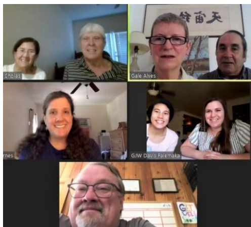
Interreligious Virtual Sharing Series in Colorado