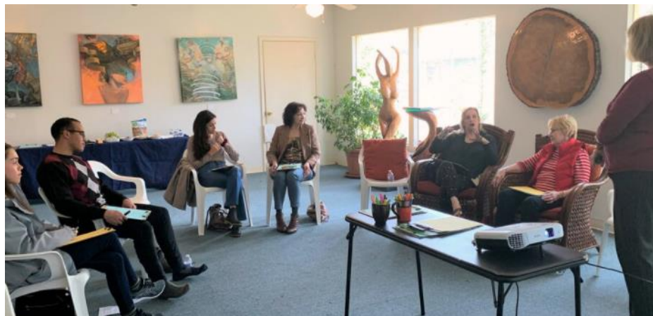
Heal Your Family, Heal the World presentation series in Georgia