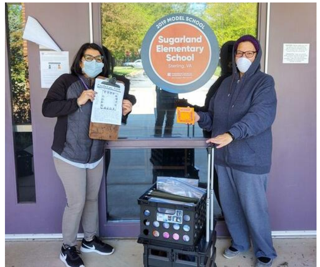
WFWP Northern Virginia Chapter donates art kits to local elementary schools