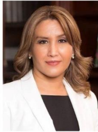
Speaker: Mdm. Hilda Patricia Marroquín de Morales First Lady, Guatemala (2016-2020)