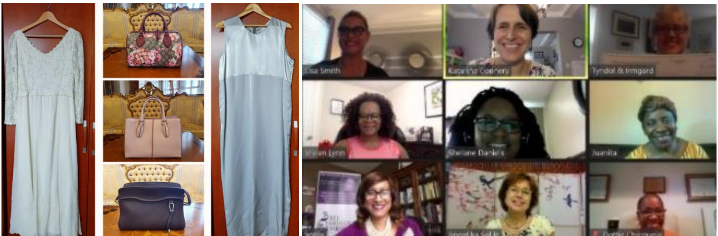
WFWP Founder Dr. Hak Ja Han Moon donated items at the launch of the Giving for Good campaign