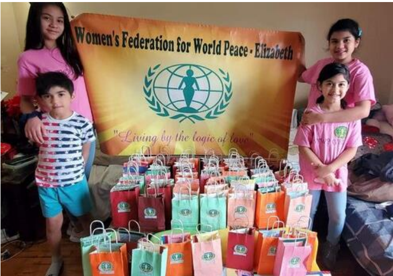
WFWP Girls send Bags of Love to frontline workers