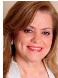
Speaker: Hon. Mdm. Emília Alfaro de Franco First Lady, Paraguay (2012-2015) Senator (2015-2018)