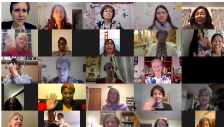
WFWP USA National Leadership Virtual Zoom Retreat