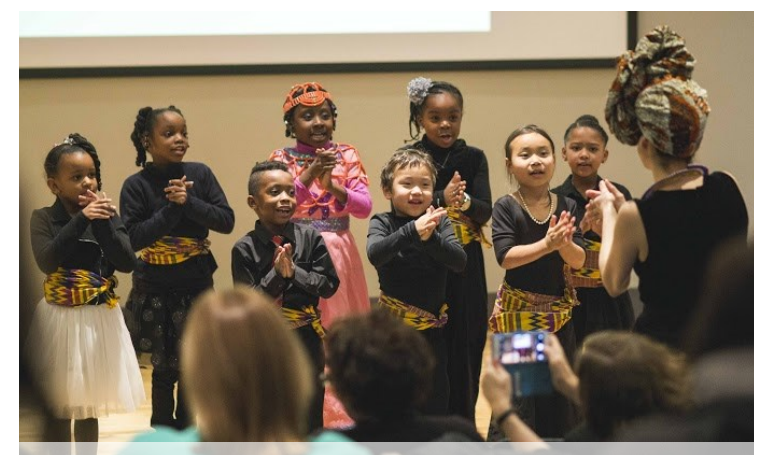
Schools of Africa Black Tie Gala - Connecticut