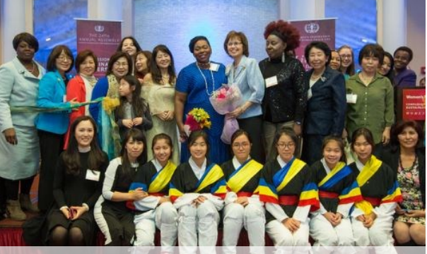
WFWP volunteers from New Jersey and New York

Notably, this year's Assembly saw an unprecedented collaboration between the national headquarters and local chapters. At the Florida retreat in July, several planning committees were formed and met to begin laying the groundwork for the Assembly. Many chairwomen jumped on board to help with fundraising, recommending speakers, planning program components, and other areas.