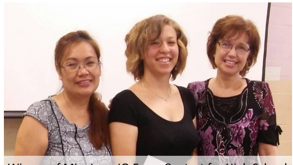
Winner of Miss Love IQ Essay Contest for High School Students - Pennsylvania

Despite these setbacks in curriculum development, chapters continued to hold Family Life Education seminars, a total of 8 for this year.