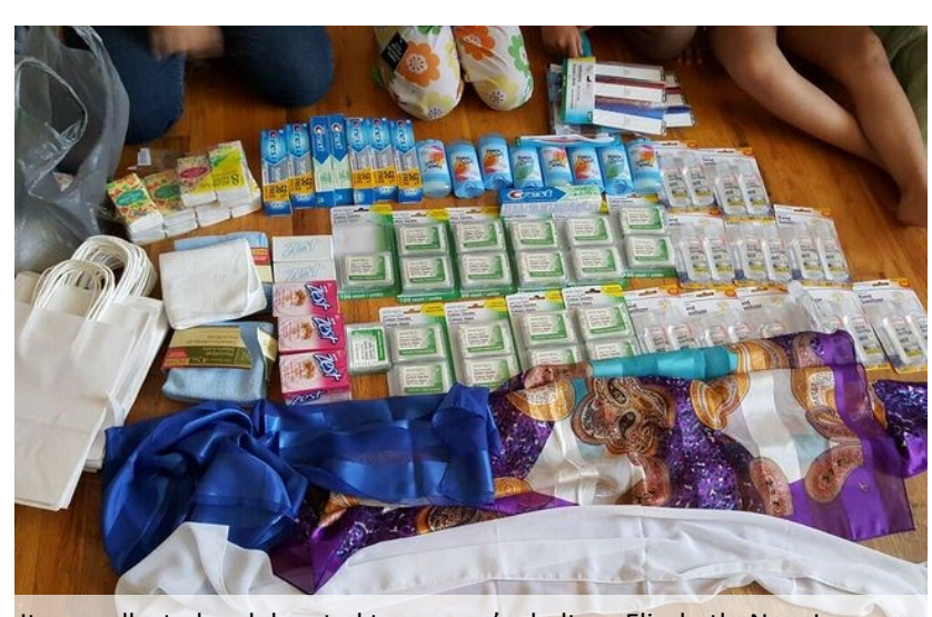
Items collected and donated to women's shelter - Elizabeth, New Jersey