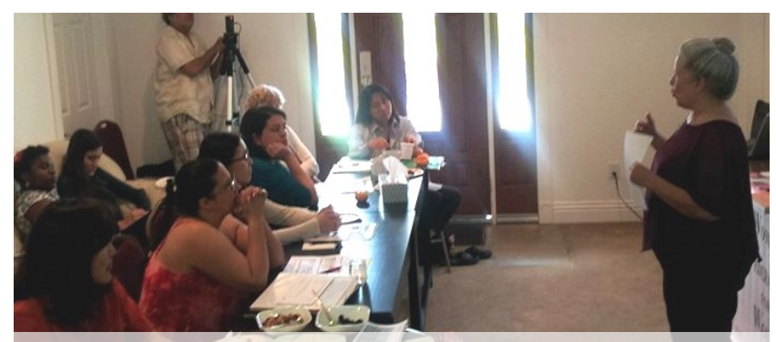
Parenting Skills Seminar with Certified Montessori Teacher - Las Vegas