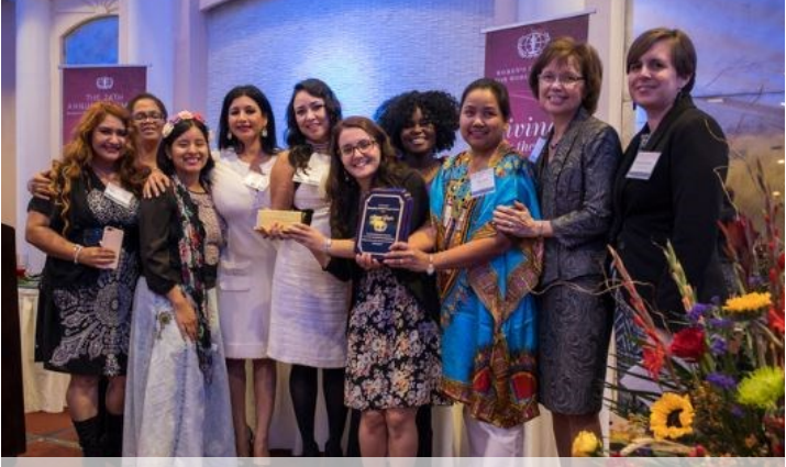
WFWP Exemplary Chapter Award 2016 - Arizona

Finally, WFWP USA honored strong and healthy marriages and families as the cornerstone of peace with a Celebration of Marriage program following the Assembly in which 4 couples rededicated their marriage. In 2017, we hope to create specific guidelines for how to collaborate with FFWPU on the Marriage Blessing.