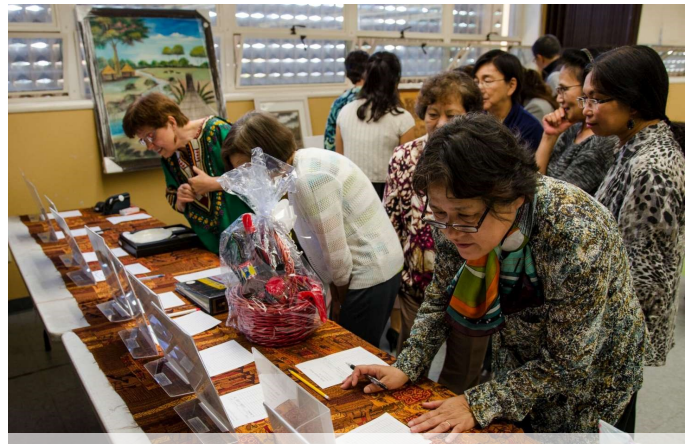
Schools of Africa Silent Auction - Northern California

This year WFWP USA held 17 local service projects, and 16 projects supporting those oversees, for a total of 33 service activities.