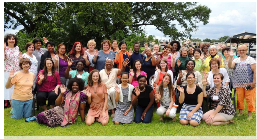
Leadership Retreat Participants - Florida