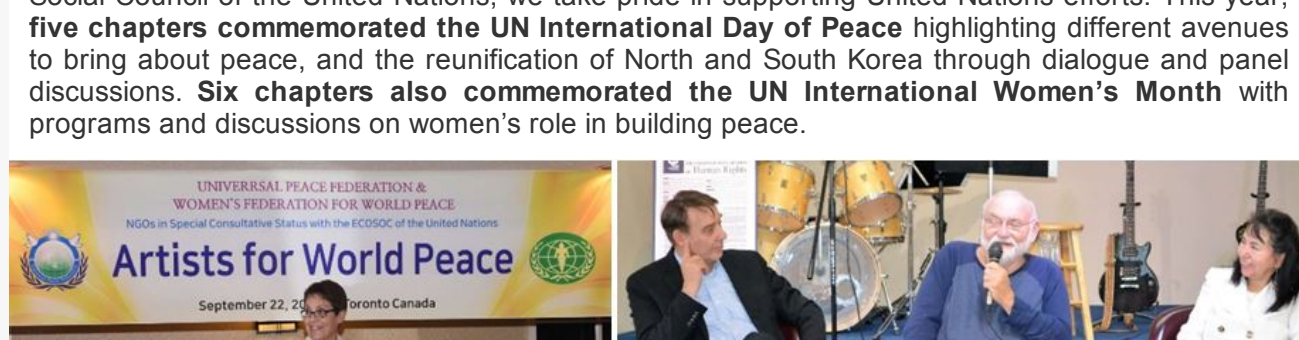
International Day of Peace Talks in Canada

- As part of an international organization in General Consultative Status with the Economic and Social Council of the United Nations, we take pride in supporting United Nations efforts. This year, five chapters commemorated the UN International Day of Peace highlighting different avenues to bring about peace, and the reunification of North and South Korea through dialogue and panel discussions. Six chapters also commemorated the UN International Women's Month with programs and discussions on women's role in building peace.