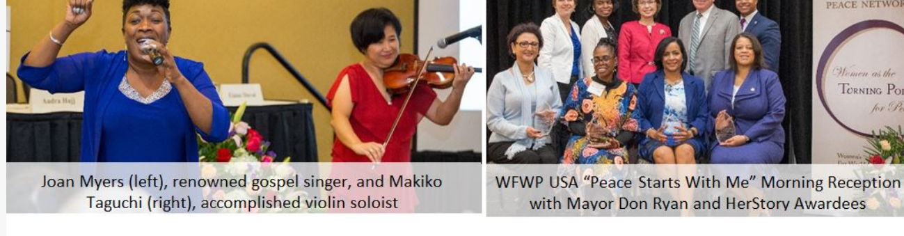
WFWP USA "Peace Starts With Me" Morning Reception with Mayor Don Ryan and HerStory Awardees

- The morning before the rally with Mother Moon, 130 guests gathered at the WFWP Peace Starts With Me Reception , where they were greeted by Mayor Don Ryan of Hempstead, NY. The highlight of the morning, along with uplifting and energizing musical performances, was to honor four extraordinary women with the WFWP HerStory Award, including NY Assemblywoman Michaela Solages who shared her tips as a woman and mother not allowing the word "no" stop her.