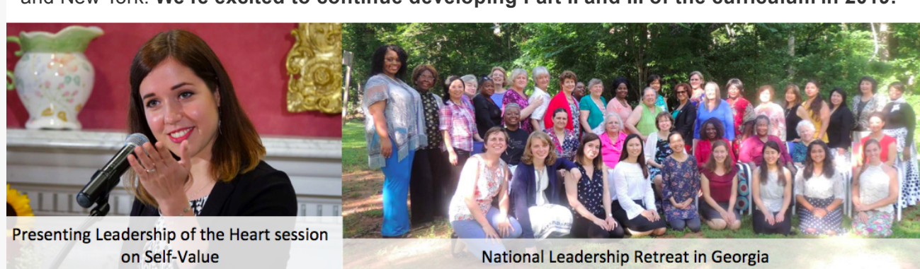
Presenting Leadership of the Heart session on Self-Value

- In support of this theme and for the first time, the DC, Maryland, and Virginia chapters spearheaded and hosted Part I of the Leadership of the Heart seminar series: Discover the Leader Within . A new and improved curriculum was shared, featuring spirituality as a core part of cultivating our true selves and being an effective leader in all areas of our lives. The interactive program which helps participants (female and male alike) discover their own intrinsic value and unique contribution to peace was also shared in chapters in California, Massachusetts, Canada, and New York. We're excited to continue developing Part II and III of the curriculum in 2019!