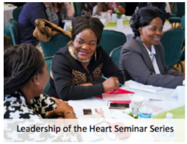
Leadership of the Heart Seminar Series

"The seminar was inspiring, uplifting and interactive. There were so many areas of the seminar that moved me, such as the meditation component. For a few minutes, I could go deeper within and connect to the divine, higher self and find peace. The presenters gave us the opportunity to understand more about the Leadership of the Heart and our own inner spirituality; that we are already divine beings, the feminine aspect of God."