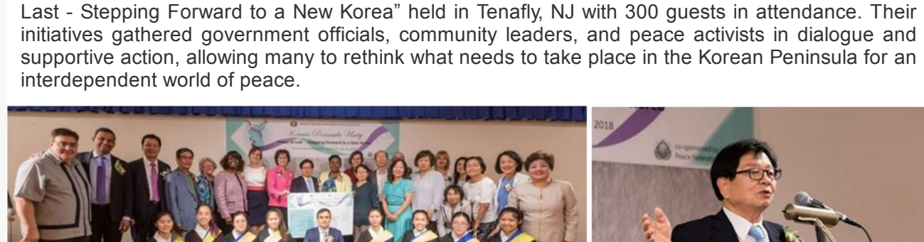
"Peace at Last - Stepping Forward to a New Korea" in New Jersey

- As the reunification of the Korean peninsula is a topic very close to our Founders' hearts, this year our WFWP New Jersey chapter held their fifth annual unity event, continuing to promote peaceful unification between North and South Korea. The event was called "Peace at Last - Stepping Forward to a New Korea" held in Tenafly, NJ with 300 guests in attendance. Their initiatives gathered government officials, community leaders, and peace activists in dialogue and supportive action, allowing many to rethink what needs to take place in the Korean Peninsula for an interdependent world of peace.