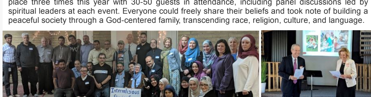
Launching of WFWP Interreligious Sharing Series in Colorado

- In support of creating a true culture of peace, a notable development in one of WFWP USA's chapters was the launch of the Interreligious Sharing Series in Denver, CO . These series took place three times this year with 30-50 guests in attendance, including panel discussions led by spiritual leaders at each event. Everyone could freely share their beliefs and took note of building a peaceful society through a God-centered family, transcending race, religion, culture, and language.