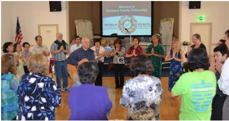
Dances of Universal Peace

General Assembly and the first Peace Day was observed in September 1982. The 2015 theme is: "Partnerships for Peace - Dignity for All," and the aim is to emphasize that all elements of societies on earth need to work together to pursue peace.