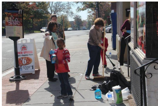
Day of Service 2015

This year's National Day of Service was the best one yet. After months of preparing for the big day everything finally fell into place and the atmosphere was filled with excitement from everyone. My