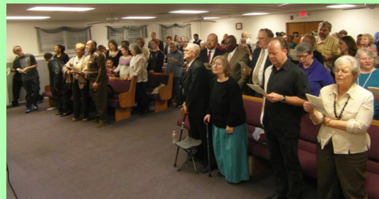
Participants practicing Dr. King's dream

Let us become truly inspired by the life and legacy of Dr. Martin Luther King Jr. For members of WFWP, his life has deep significance as we work to promote peace through reconciliation and breaking down the barriers between race, religion, culture, and nationality to see each other as siblings, not rivals. As we are all the children of the one Creator, the Heavenly Parent, we will continue to work to promote "One Family Under God" in all our activities this year.