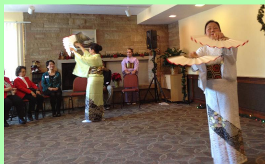
Japanese dance to Sakura music