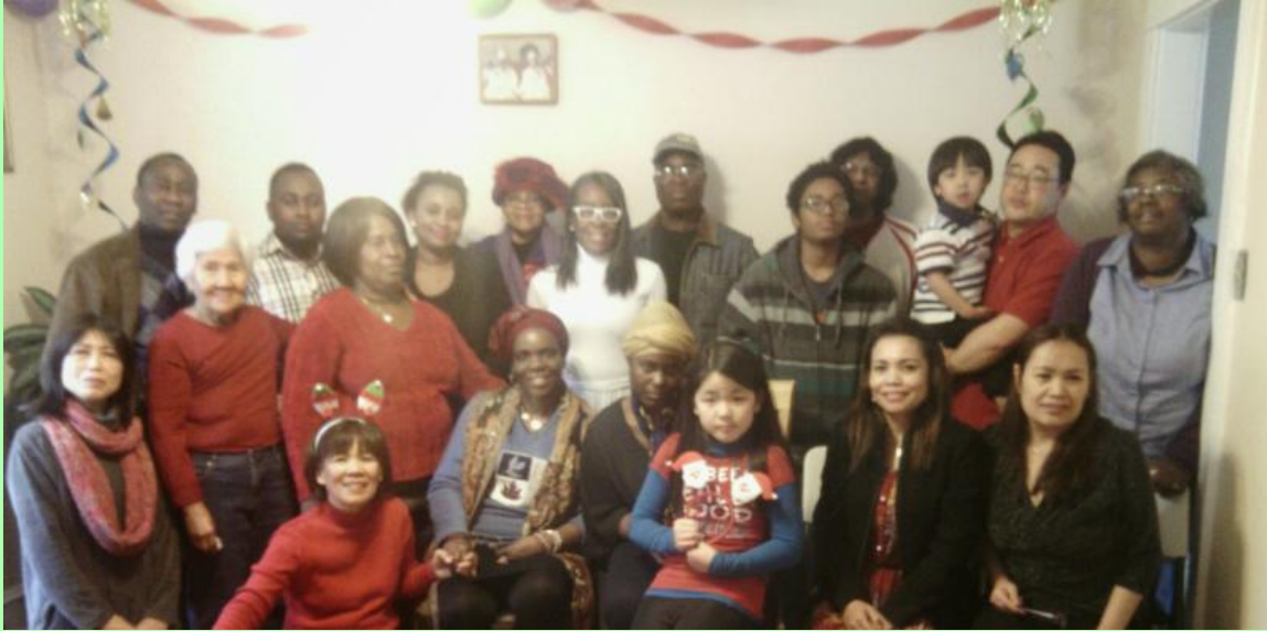
Group photo after the holiday festivities