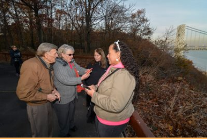
Touring in Fort Lee, New Jersey

deliver a baby in the countryside than a doctor who had just seen a person with scarlet fever? It turns out that the early settlers did not know much about infection control and that disease was rampant.