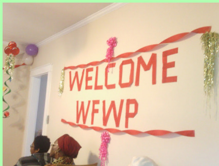
WFWP welcomes participants