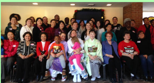
Group photo after the festivities

The Minnesota chapter of WFWP collaborated with the local chapters of the American Clergy Leadership Conference (ACLC), Universal Peace Federation (UPF), and the Family Federation for World Peace and Unification Youth Group to generate a festive holiday party on December 6.