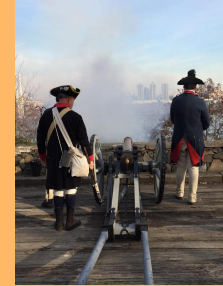
Firing the cannon