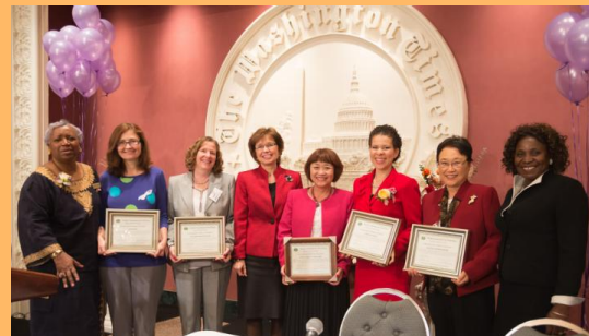
Schools of Africa benefit award recipients