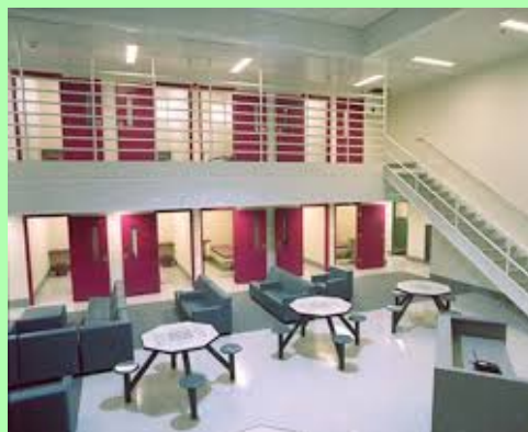
Inside the Juvenile Detention Facility

It was a most suitable day to remind the girls to have a dream and to hold on to it - a good dream, a dream of love. I wrote on the board two acronyms for love: Love Overcomes Victoriously Everything, and Live On Values Eternally. Also, I encouraged them to discover what they are good at, such as writing, playing music, working in the medical field, etc. It is good for us to be creative and productive.