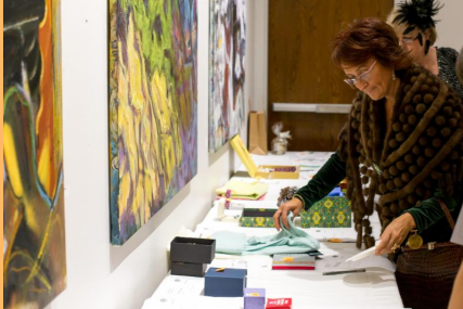
Silent Auction at black-tie SOA benefit in Connecticut

WFWP chapters around the United States in 2014 found many creative ways to raise funds for African students yearning for education. For example, in Northern Virginia for some time now the church youth group has promoted a "leaf-raking fundraiser" to raise money. This