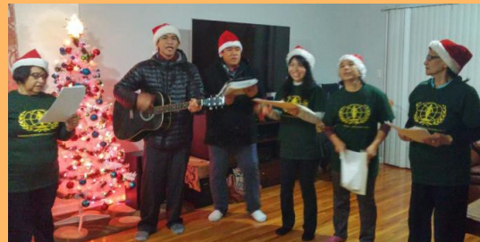
Carolers delight the homes

Most especially, we thank the WFWP members and their families who joined the team for the four nights. Share and comment on our website!