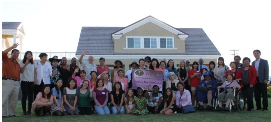
2013 WFWP Mother's Day Celebration in Las Vegas