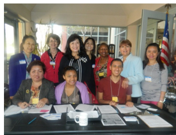
At West Las Vegas Arts Center

"Thank you again for your heartfelt investment, love, and dedication to WFWP in Las Vegas, in seen and unseen ways, and best of luck with your studies!