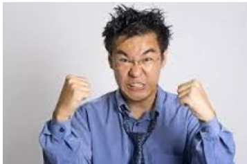
Empowered by grudges

Holding on to grudges usually makes people feel powerful and