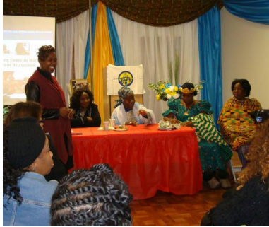
The panel discussion