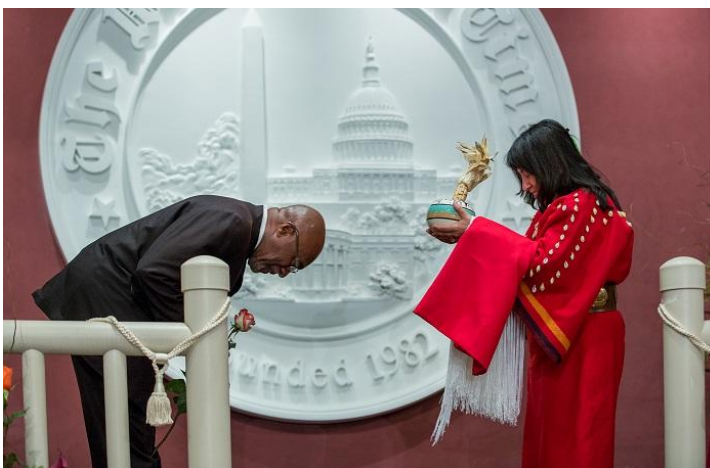
Bowing in repentance and forgiveness

In our many efforts to comfort God's painful heart, one way is to reflect and act on hereditary transgression which is transgressions inherited from one's ancestors through the blood lineage, as mentioned in the