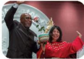
The Bridge of Peace and reconciliation projects