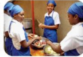
Schools of Africa benefits