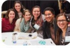
Character and values education for youth