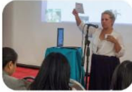
Educational programs on healthy family relationships