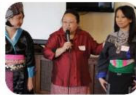
Seminars on human rights and women's dignity