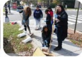
National and local service projects