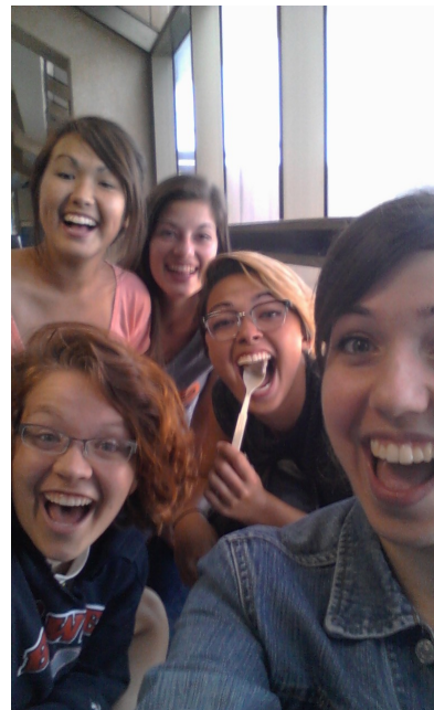
On the way to Alaska

I found the first step to leading a group is making sure they know where they are going. In our team, we spent time every day to consider a deeper motivation behind the work that we were doing. Whether it was to become a stable and hard worker with integrity, or to become a more selfless and caring person, each person had an underlying goal besides simply raising more money. This self-reflection was the starting point of inspiration, dedication, and passion.