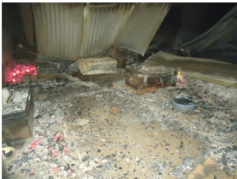
A section of the burnt dormitory