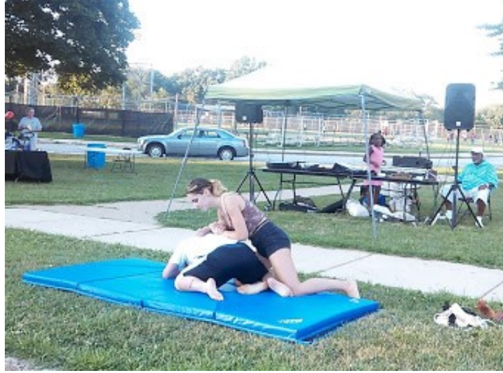
Martial Arts demonstration

For the Pennsylvania Chapter of WFWP, this is the third consecutive time joining this event. It is easy to see why children love this event. Great refreshments are served and the entertainment is fun. It is a peaceful, educational, and entertaining way of helping neighborhoods!