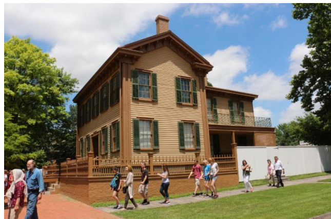
Abraham Lincoln's Home

Our passionate weekly preparation meetings were memorable because each of us wanted to share the responsibilities and provide an educational experience for all the participants. The greatest thing that came out of the trip was the effect on the younger participants. Two young people even spoke to our community on June 21 about their impressions.