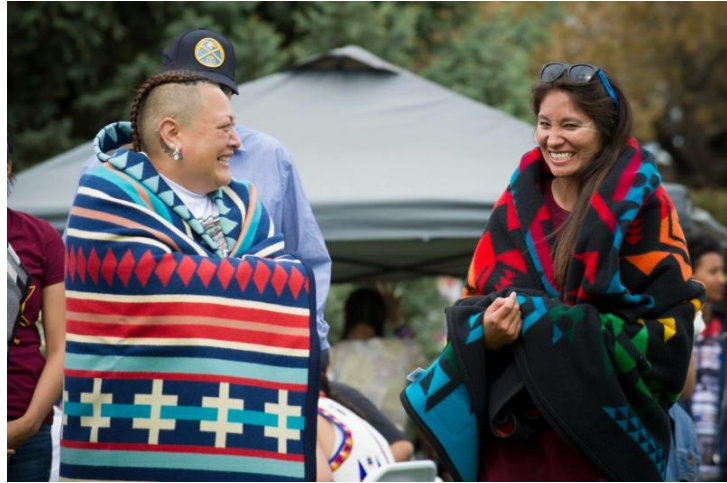
Enjoying community at a powwow