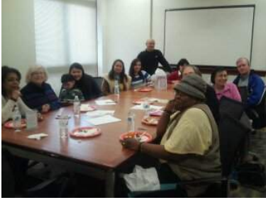
Discussing peaceful relationships

through Relationships." She explained that the first step in any relationship is to become self-aware. When a difference arises, try to become aware of your own thoughts, feelings, needs, and ego.