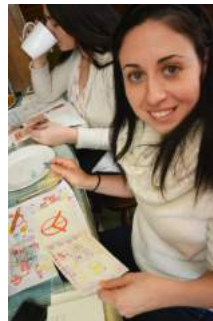
Young ladies creating

Here are photographs from our February 28th event. Thank you to everyone who helped in providing and preparing food and refreshments. Love Post was such a success that we will be having the second Love Post event in April. All are welcome, but space is limited.