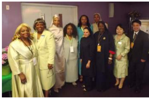
Women working together for peace

merged to re-ignite the presence of Women In Ministry (WIM), which is a project of ACLC, for the Chicago and Midwest area.