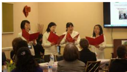
Japanese Women's Peace Choir