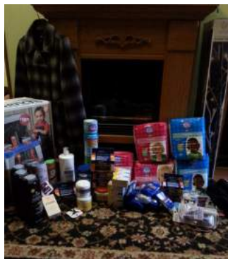
Some of the donations