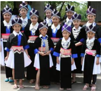
Contemporary Hmong in America

On February 7th, several members from the Minneapolis WFWP chapter attended a workshop given by the Hmong Nationalities Organization (HNO). For those of you who may not be familiar with the Hmong people, they are a distinct ethnic group with ancient roots in China. They