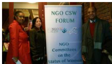
CSW New Jersey participants