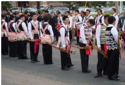
Traditional Hmong Men's clothing