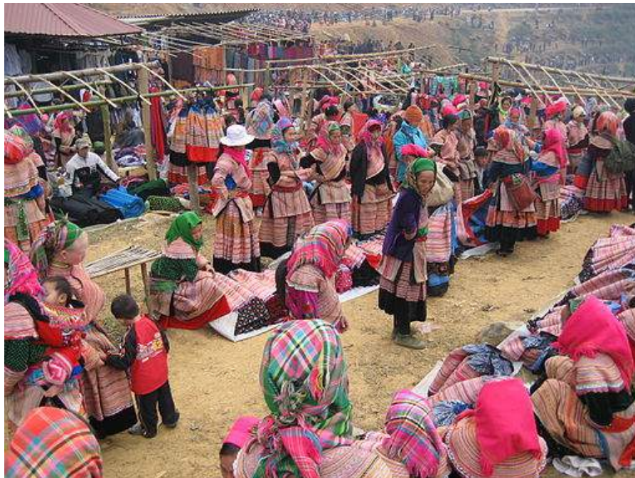
Can Cau market, Flower Hmong (Arian Zwegers)