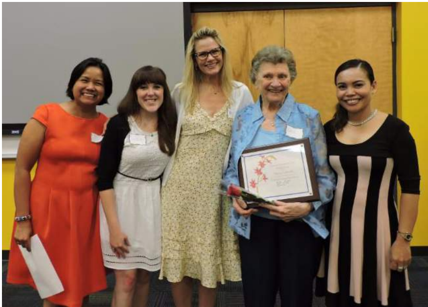
Women honored for exemplary service and heart