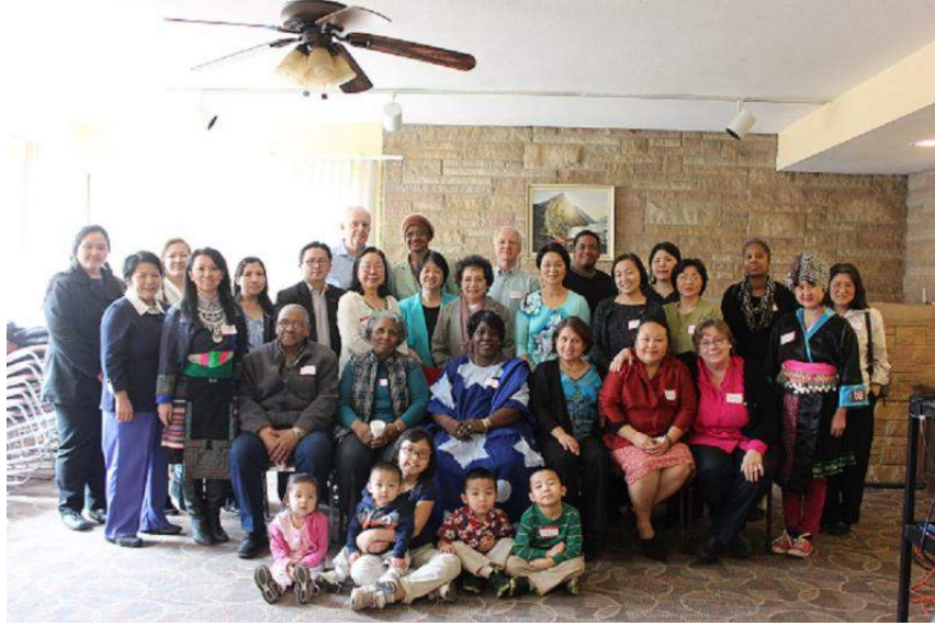
Embracing the Hmong people