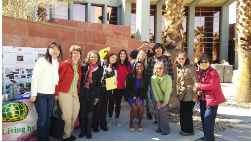
The team on campus telling students about the Solving Racism event