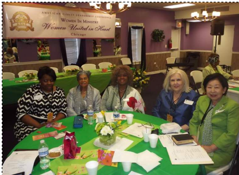
Women united in heart for peace