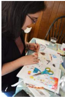
Working on Love Posts

As St. Valentine's Day came and went, one of WFWP Westchester's women's groups carried the love-themed saint's day through to the end of the month. At this month's meeting we held the first "Love Post" event. "Love Post" is a new concept and activity created specifically for WFWP meetings. It is the act of hand-making and sending postcards anonymously to people in our local community.