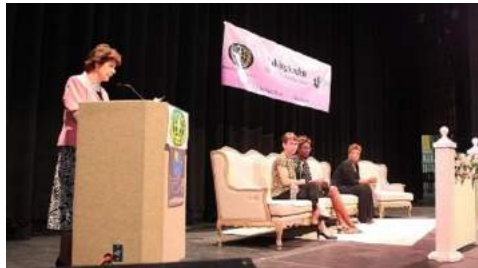
The Panelists listening intently