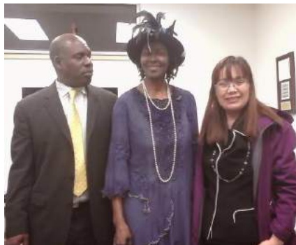
Smiling together after the speech

As for me, even though I am used to speaking before people, I felt so insecure before they called me up to speak. This time, with over 70 community leaders and council members, I was so anxious and had no confidence. But, as I was giving my speech I felt strong energy coming to me. I felt the founding spirit of WFWP cheering me on. I felt proud that I could represent the great and valuable gift that is within WFWP. With that strength I introduced WFWP to those assembled.