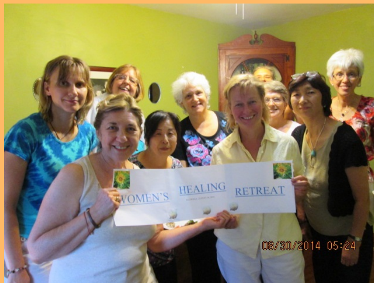
Renewed and Revitalized