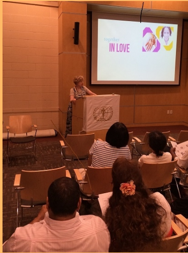
Presenting Principles of Peace Continue reading...

testimony about the bus tour because that has been done already in other articles. What I do want to mention, though, is that I was reminded deeply of my own responsibility for improving the culture of America.