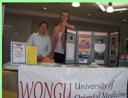
Wongu University exhibit

Even though the event was held on a Saturday, as it was the last weekend before the new school year began, we didn't see as many guests as we had hoped. Luckily, there were enough to make the event worthwhile, and those who attended received much information and had a great experience.