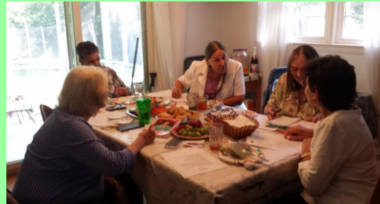
Planning action steps