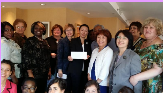
WFWP Leaders in New York