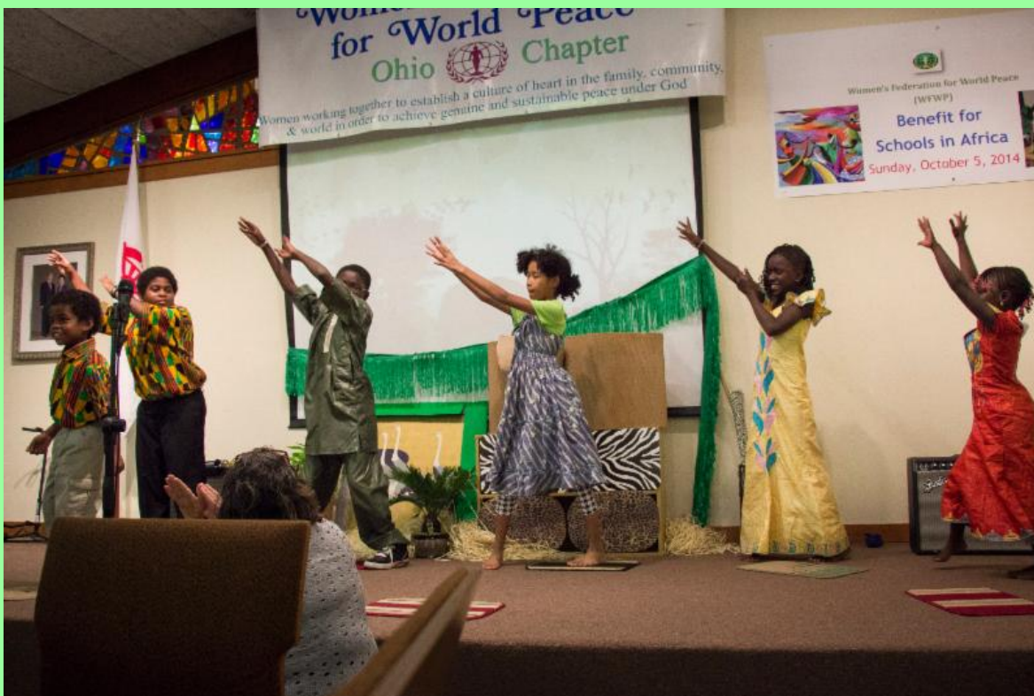
Young African dancers perform