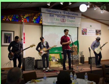
Soul Monster Band