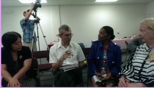
Lively discussion groups