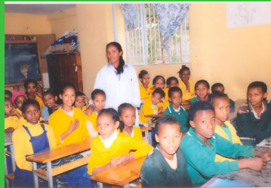
Ethiopia: One Hope Garden Primary in Session