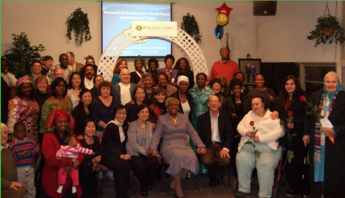
After a successful Bridge of Peace Ceremony