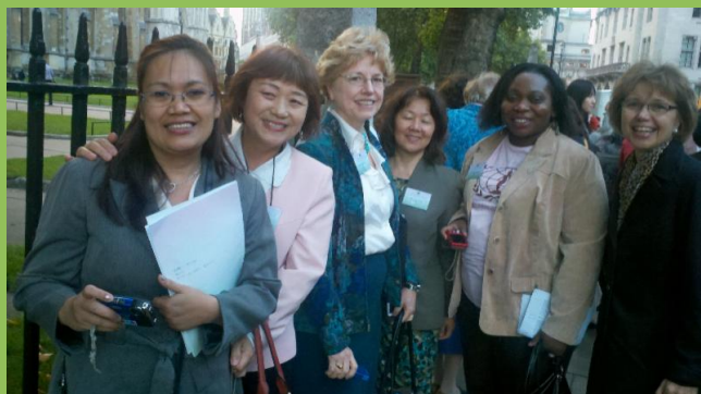
Informal Photo of most of USA Team in London

Approximately one hundred women traveled from all over the world to London, England, for the 13th annual WFWP International Leader's Conference. Held in the heart of London at the Royal National Hotel, Russell Square, from October 7th - 10th, WFWP leaders joined with representatives from other NGOs, government, and religious groups for two and a half days of intensive education and sharing. Far more important than information was the wisdom shared by these leaders through their efforts in various countries and cultures.