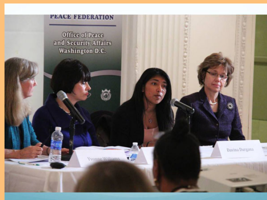
Panelists Listen and Present

Last year I noted that it would be very hopeful if men would also join the panel since both parties are involved and the solution also needs come from their side and with their input.