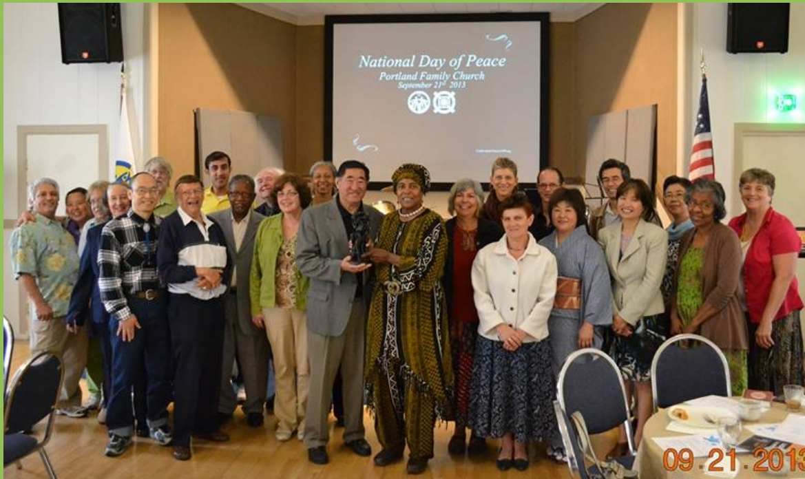
WFWP, ACLC, FFWPU Internation Peace Day Celebration

Click here to share this story or leave a comment