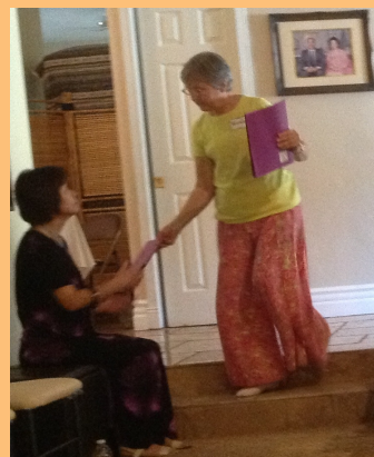
"Color Me New" Participants

Each lady chose a session that interested her, such as: the infra red body healing, the chi machine, the emotion code, journal magic, or beauty naps. A healthy and nutritious lunch and dinner were served which also contributed to the well-being of the ladies. At the end of the evening we watched a video by Dr. Brene Brown, a researcher-storyteller, called "Vulnerability."