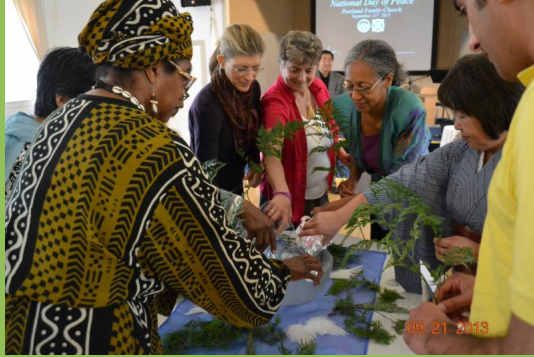
Water Unity Ceremony

ceremony." All the faith representatives poured their cups of water into one bowl, symbolizing the unity of all faiths. They then dipped a "peace branch" into the large bowl of peace water and sprinkled a blessing on all the attendees.