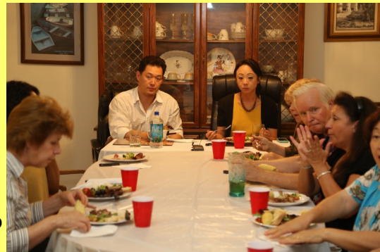
Dinner with Founder's Son and His Wife