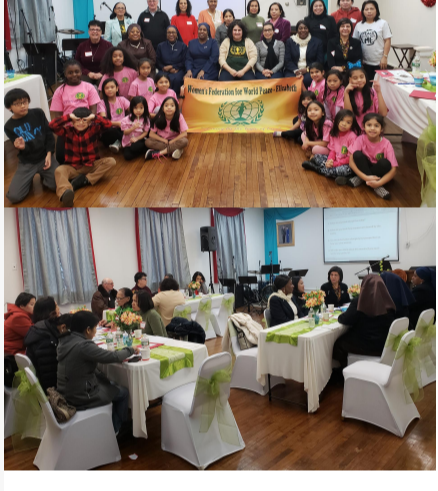
TABLE TALK: HOW WOMEN ARE PORTRAYED BY MEDIA

Hollywood movies, television shows and advertisement campaigns all have something in common: their misrepresentation of women. This may have something to do with the fact that the majority of them are written, directed and produced by men. As a powerful tool of influence in society, media is a relevant topic that needs to be addressed.