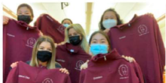
Nursing Students Fundraise to make a Contribution for the Cambodia Project

The Nursing Student Organization (NSO) at Ramapo College of New Jersey (RCNJ) was inspired to donate proceeds from their annual apparel drive to the Cambodia Foster Care Project. The project currently supports 66 students with a scholarship for their continued education. A national TV station in Cambodia also covered the project this year.