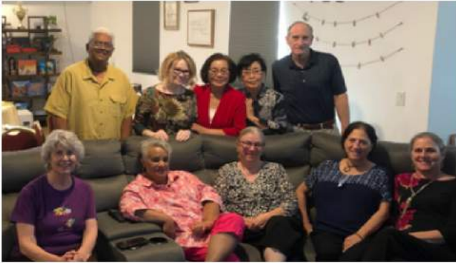
WFWP Las Vegas Watch Party

WFWP's 30th anniversary was truly a radiation of women's empowerment. The past laid a strong foundation for the present. The present is a challenge to the future. Therefore, let's take courage for the realization of world peace through women's leadership whether in our family, community, nation, or to the world – big or small counts towards difference.