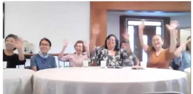
WFWP Hawaii Watch Party