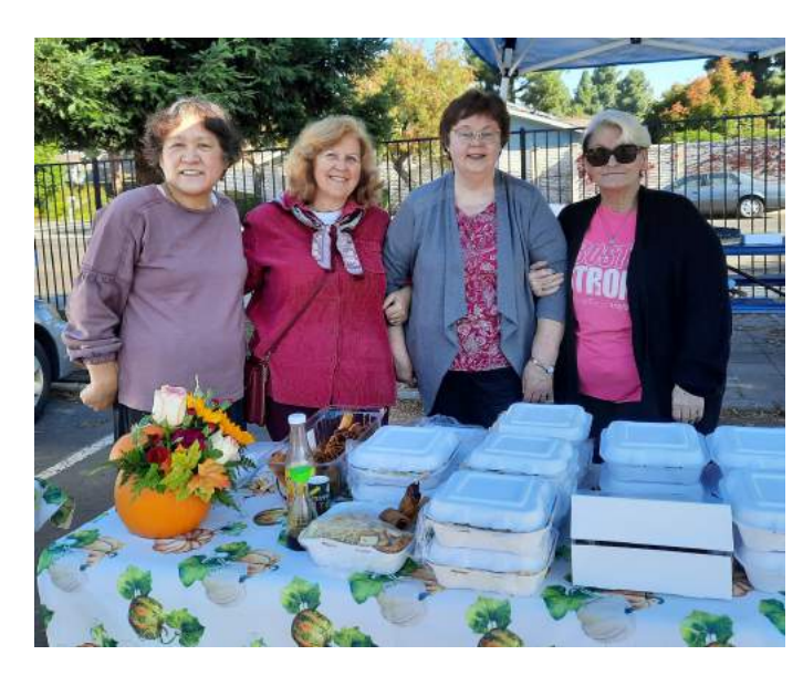
Benefit for Schools of Africa in Northern California

Each year, local chapters and members across the USA organize innovative and engaging events to raise funds for the Schools of Africa Project with ten schools throughout eight African countries. These funds have helped to continually maintain the schools, finance school supplies, improve buildings and classrooms, secure funds for scholarships to low-income students, and much more.