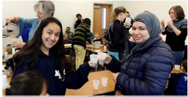
Making green monster smoothies