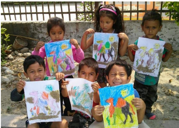
Building a safe, loving kindergarten in Nepal

These results provide education in nine schools in eight African countries, the building of a kindergarten in Nepal, and provide one year of education, books, and school meals for 66 students in Cambodia, and more!