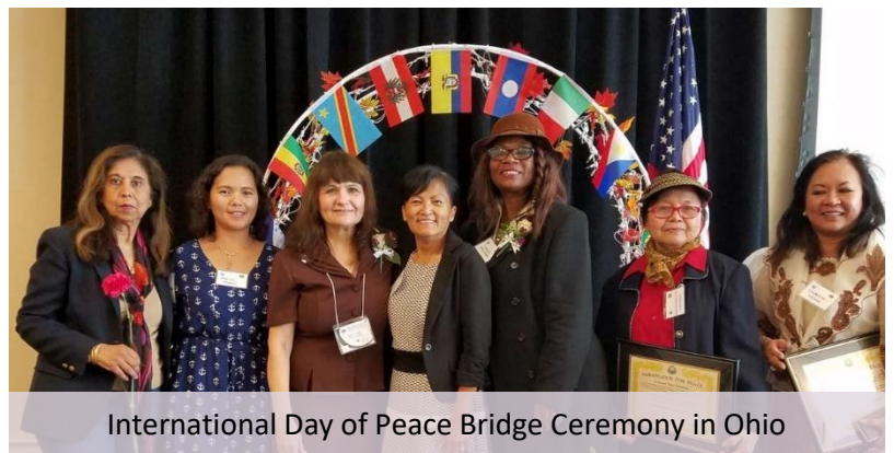
International Day of Peace Bridge Ceremony in Ohio