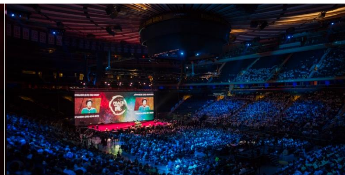
Dr. Hak Ja Han Moon speaks on “Peace Starts With Me” at Madison Square Garden, July 15, 2017