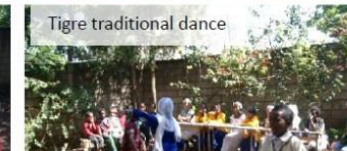
WFP One Hope Garden Primary School in Ethiopia