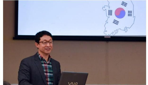
2017 sharing the importance of a united Korea