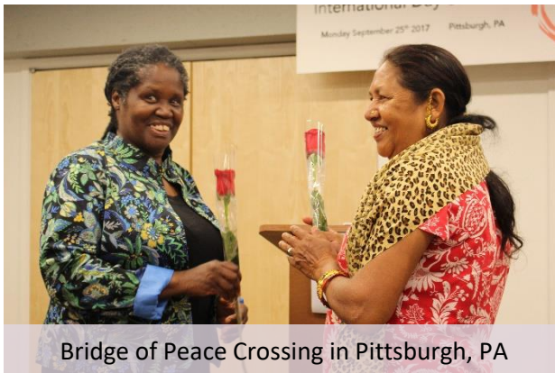
Bridge of Peace Crossing in Pittsburgh, PA