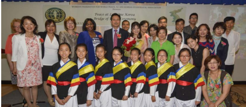
Peace at Last One Korea, Bridge of Peace in New Jersey, 2015