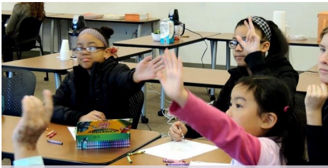
Interactive nutrition seminar in Bridgeport