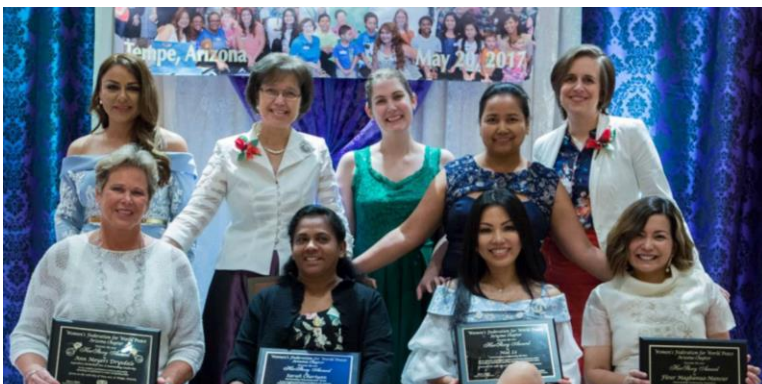
Global Women's Peace Network 25 th Anniversary in Arizona

Commemorate the year with us by watching the WFWP International video shared at their Anniversary Celebration here: https://vimeo.com/238656821