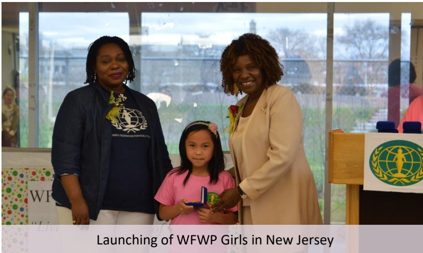
Launching of WFWP Girls in New Jersey