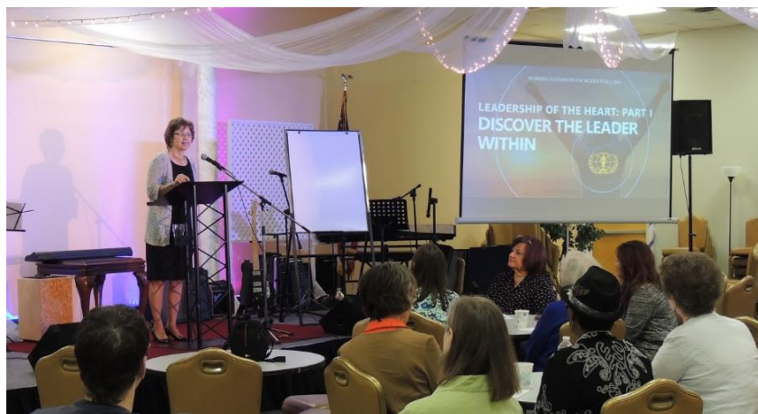
Launching of Leadership of the Heart Curriculum in Maryland