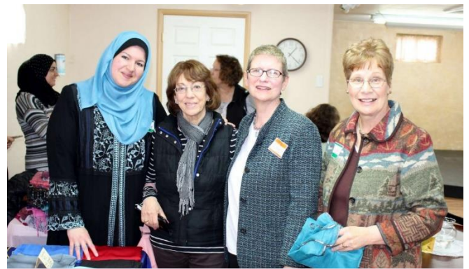
25 th Anniversary and Networking Fair in Colorado