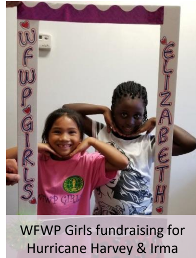
WFWP Girls fundraising for Hurricane Harvey & Irma