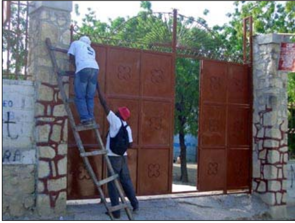
The completed front gate