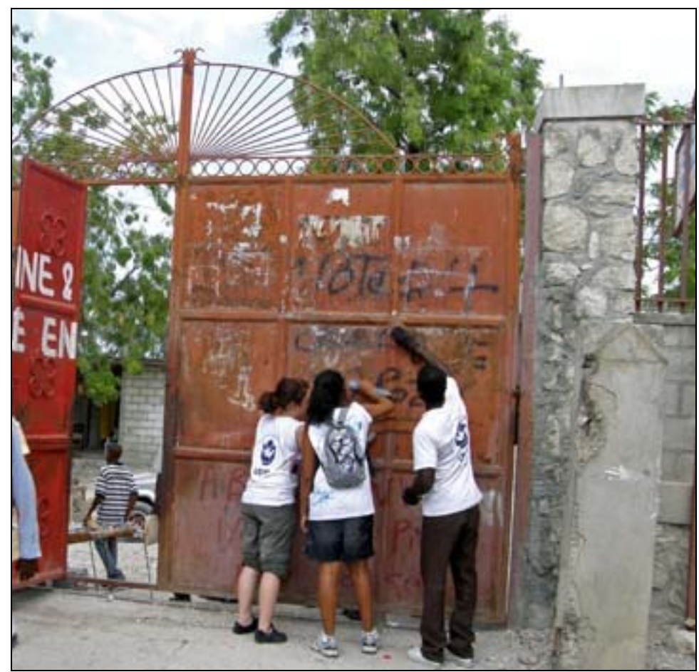
Washing and scraping the front gate of the school