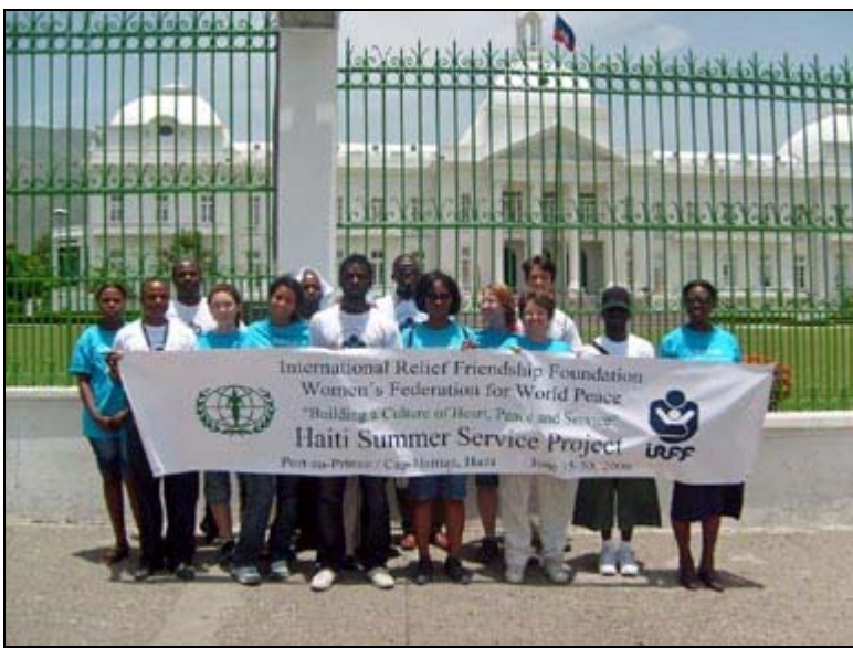
At the Presidential Palace, Port au Prince, Haiti

On Friday, June 27, the group had an audience with the Chief Justice of Haiti's Supreme Court. They learned about Haitian law as compared to U.S. law. Then they visited Haiti's Parliament, the Ministry of Culture, and the Institute of Ethnology, a university which focuses on social sciences. At the university, WFWP members handed out flyers supporting pure love and abstinence before marriage, and they met many students who were aware of the ills of their society and yearned to do something to solve them.