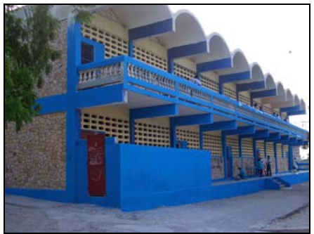
The "new look" for the Antoine Georges Secondary School

On Friday, June 27, the group had an audience with the Chief Justice of Haiti's Supreme Court. They learned about Haitian law as compared to U.S. law. Then they visited Haiti's Parliament, the Ministry of Culture, and the Institute of Ethnology, a university which focuses on social sciences. At the university, WFWP members handed out flyers supporting pure love and abstinence before marriage, and they met many students who were aware of the ills of their society and yearned to do something to solve them.